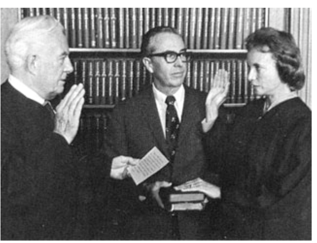
After being confirmed by the U.S. Senate on September 22, 1981, Sandra Day O'Connor took her oath of office as Associate Justice of the Supreme Court, pictured here, on September 25.

On September 21, 1981, Sandra Day O'Connor was unanimously confirmed by the Senate as the first woman Justice on the United States Supreme Court. Often referred to as the "swing vote" on the bench, Justice O'Connor established a reputation for delivering pragmatic decisions on a case-by-case basis, not according to party influences. Critics have read O'Connor's methodology in rendering decisions as "playing the middle while watching how the majority leaned," while other pundits found the term "swing vote" a misnomer. Many such observers identify O'Connor's record as an adherence to her roots as a Goldwater/Reagan Republican, as opposed to an alliance to the shifting ideologies within the Republican Party. The Justice's much publicized rural upbringing on her parents' ranch, called the Lazy B, in southeastern Arizona